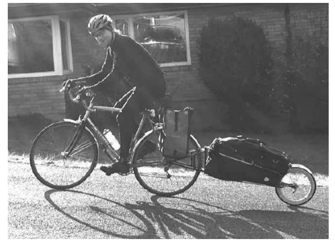
Me, commuting on a sunny winter day in November. Notice I'm smiling even though I'm pulling over 100 pounds up the hill. That's what comfort can do for you;-)

I guess the moral of the story is: Treat your commuter as your prized possession, and it'll keep you wanting to ride all year. There's no reason to think of it as a throw away bike.