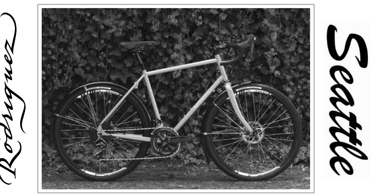
The Rodriguez Phinney Ridge - from $2,599